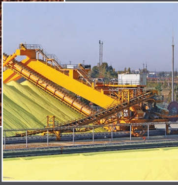
Monospiral Reel on a Portal Stacker, Russia Travel Length: 480 m

Up to 24 channels. Range of sizes available up to 120 turns.