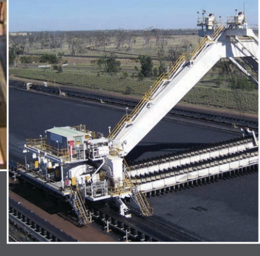
Level Winding Reel on a Portal Reclaimer, Australia Travel Length: 680 m