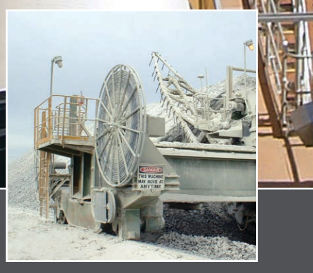
Monospiral Reel on a Stack Rake, USA Travel Length: 320 m

Level Winding Reel on a Stack Rake, USA Travel Length: 1500 m