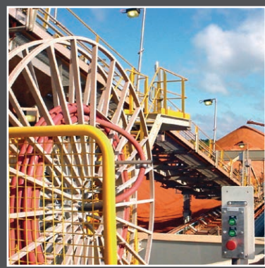
3-2-3 winding Reel on a Stacker, Australia Travel Length: 360 m