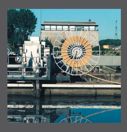
Motorized cable reel on a linear scraper bridge

Special versions of our high quality products resist the harsh conditions in these aggressive atmospheres, ensuring reliability and low maintenance costs.