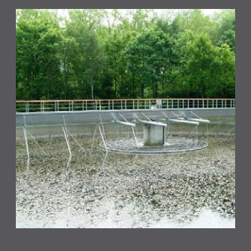
Slip ring assembly on a circular scraper bridge

Today more than ever, the performance demands of waste water treatment plants rely on proven, reliable technology.