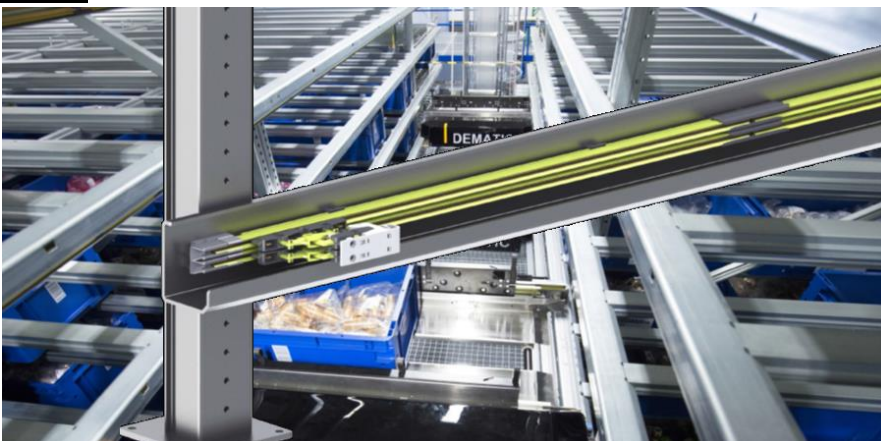
Caption: MultiLine 0835 for continuous supply of shuttles, including level change via lifters.